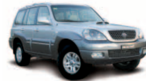
H: Terracan 4WD