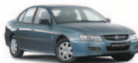
F: Holden Commodore