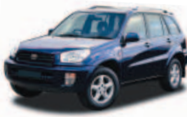
E: Toyota RAV 4