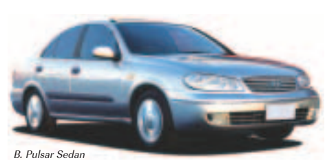
B: Pulsar Sedan