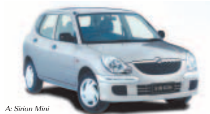
A: Sirion Mini

All vehicles are fully air-conditioned, have power steering and come with an in-car CD/radio audio system. Your vehicle hire includes 24 hour road side assistance for peace of mind.