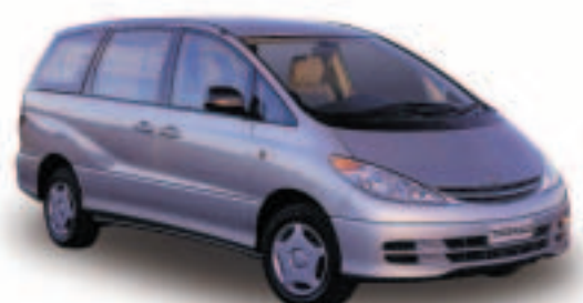
T: Toyota Tarago