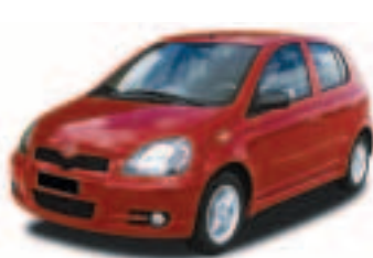
A: Toyota Echo