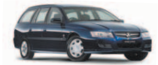
C: Holden Commodore Wagon